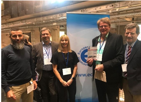
Members of the Student eID Framework project advisory committee at the eID Forum

In conclusion, the organisation and management of this event was of a very professional high standard, it provided an excellent opportunity to network and for knowledge sharing from the sessions delivered by global experts in the industry.